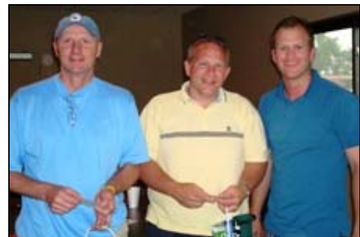
The Top 2 Teams of the Tournament!!