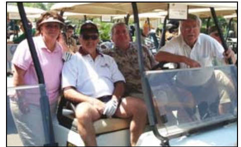
These guys and gals are having fun even before and after