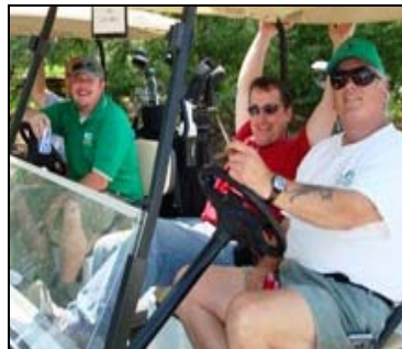
Having fun relaxing on the course